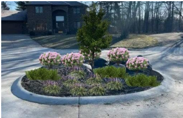
Rendering of Ruskin Court cul-de-sac