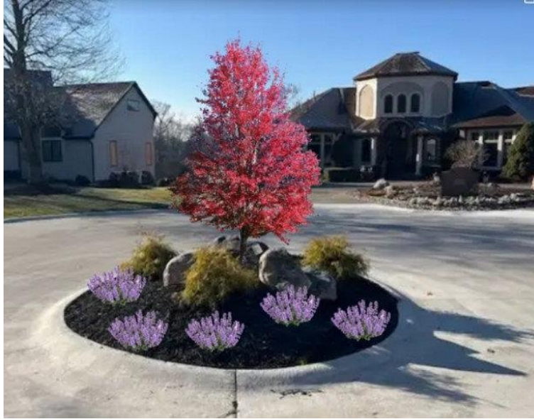
Rendering of Hera Court cul-de-sac

updated. Below are renderings of what the cul-de-sacs will look like when complete.